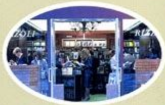
RIZZOLI BOOKSTORE AT THE WORLD FINANCIAL CENTER

TORS THAT WHISK YOU TO YOUR FLOOR...WHERE THE VIEW OF NEW YORK HARBOR IS SPECTACULAR. • AND IT'S IN THE HEART OF A CITY THAT'S SECOND TO NONE.