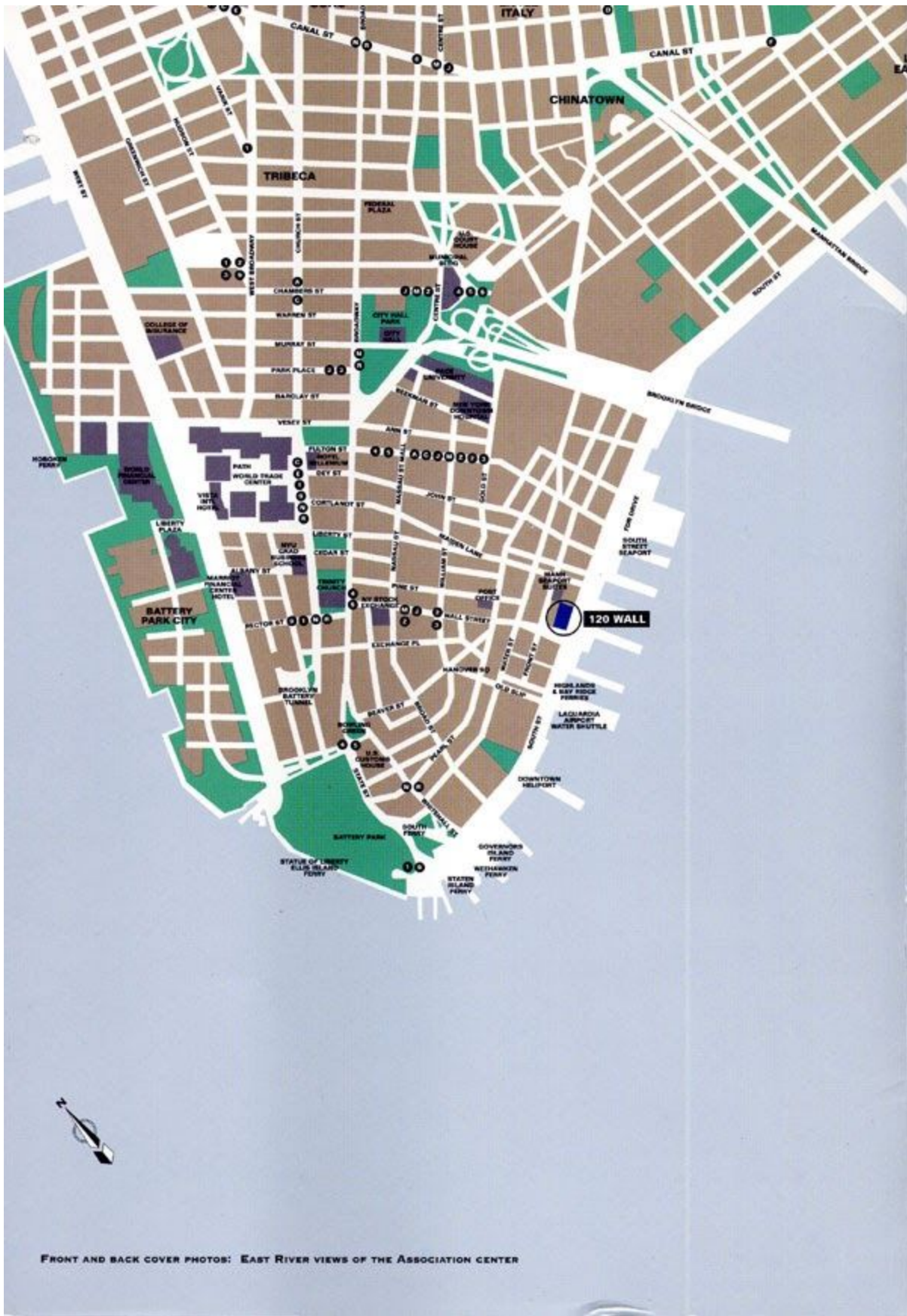
FRONT AND BACK COVER PHOTOS: EAST RIVER VIEWS OF THE ASSOCIATION CENTER