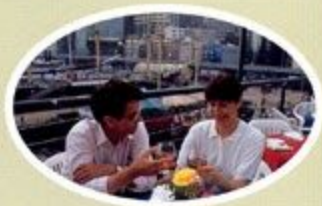
SOUTH STREET SEAPORT'S PIER 17

NIFICANTLY REDUCE BUSINESS COSTS. • BUT IT'S MORE. IT'S A FIRST-CLASS FACILITY TOWERING 34 STORIES OVER LOWER MANHATTAN...WITH A GRACIOUS LOBBY AND CARPETED ELEVATORS