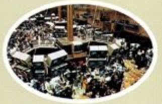
NEW YORK STOCK EXCHANGE

TO CALL THEIR VERY OWN: THE ASSOCIATION CENTER. • DESIGNED ESPECIALLY FOR NOT-FOR-PROFITS, THE ASSOCIATION CENTER IS A PLACE WHERE YOU AND YOUR COL-