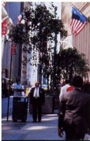
PICTURED ABOVE: THE ASSOCIATION CENTER'S ELEGANT ART DECO ENTRANCE AT 120 WALL STREET. BELOW: WALL STREET BY DAY AND THE WORLD FINANCIAL CENTER AT NIGHT.