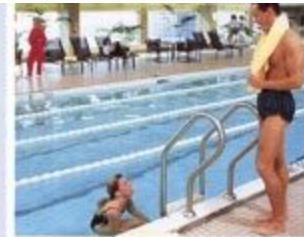
JUST A QUICK WALK FROM THE ASSOCIATION CENTER, YOU CAN TAKE IN THE SITES AT THE SOUTH STREET SEAPORT, ENJOY A PERFORMANCE AT THE WORLD FINANCIAL CENTER'S WINTER GARDEN OR WORK OUT AT THE VISTA INTERNATIONAL HOTEL'S EXECUTIVE FITNESS CENTER.